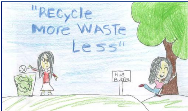
• Madeleine Verby, Oakdale Elementary, Grade 5